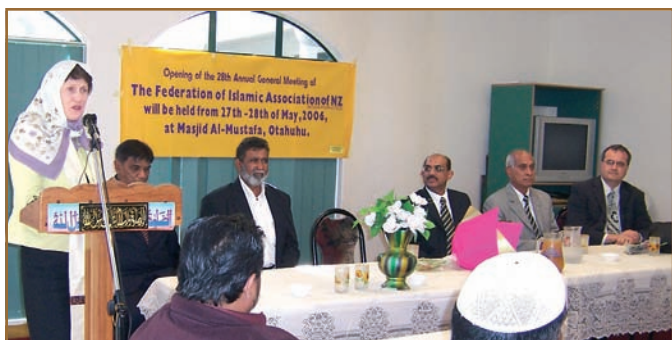
Rt Hon Helen Clarke, Prime Minister, addressing at the AGM 2006

She also alluded to the "cartoons" saga and praised FIANZ for adopting a constructive process to build better understanding with community at large and the media in particular.