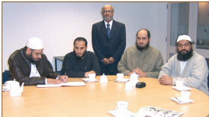
Visiting Scholars from Saudi Arabia