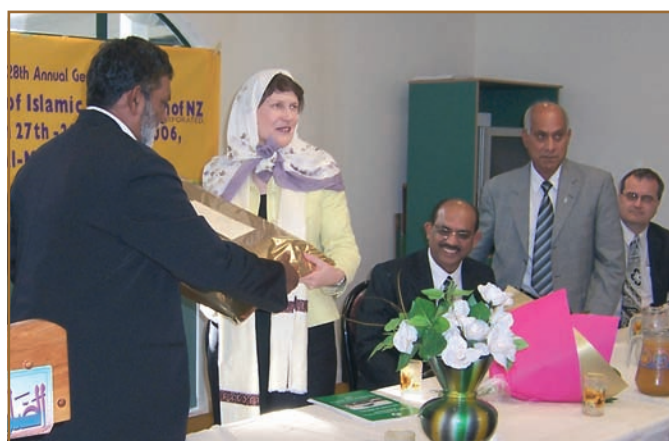
"Token of Appreciation" presented to Prime Minister by President of SAMA