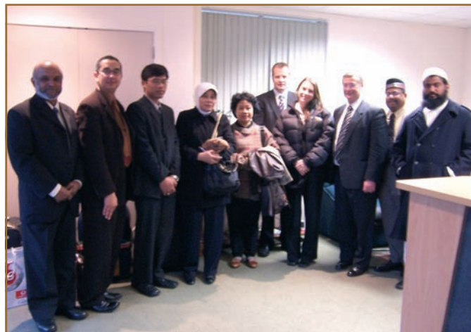
Officials from Indonesia Embassy, Indonesian Audit Team, NZ Food Safety Authority, Ministry of Foreign Affairs and Trade & Meat Industry Association

At the end of the presentation, they enjoyed afternoon tea with us.