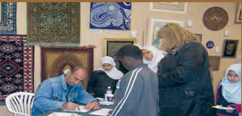
Displaying the talent of Islamic Calligraphy writing during the IAW Open Day at the Wellington Islamic Centre