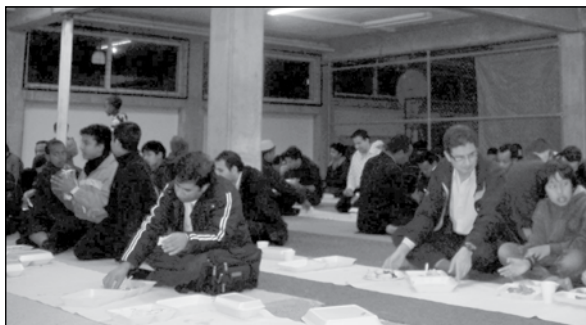
Community Iftar by Arab Community

In the month of Ramadhan, the Wellington Islamic Centre comes alive during weekends and some weekdays with the gathering of the community for Iftar (breaking of fast). True to its name - International Muslim Association of NZ (IMAN), the cosmopolitan Wellington Muslim community is made up of Muslims from various part of the world - Cambodia, Malaysia, Singapore, Indonesia, the Najashi community (Ethiopia and Eritrea), Somalia, Iraq, Palestine, Syria, Morocco, Kuwait, Fijian, Sub-Indian Continent, Europeans (Germany, United Kingdom) and Turkey. So far, following Iftar functions were held at the Wellington Islamic Centre: