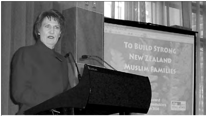
The RT Hon Helen Clark addressing the gathering