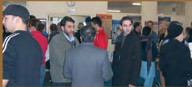
Section of crowd during the IAW Open Day at Wellington Islamic Centre