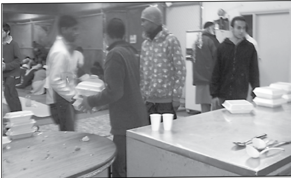
Community Iftar by Wellington Youth Group