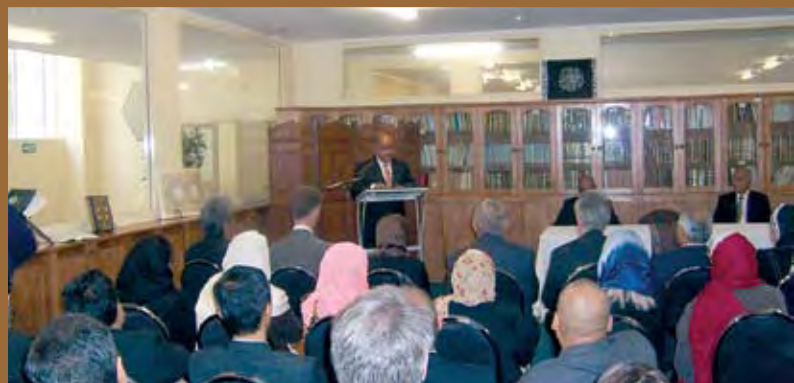
HE Hon Anand Satyanand, Governor-General of New Zealand at the official launch of the Islam Awareness Week 2008