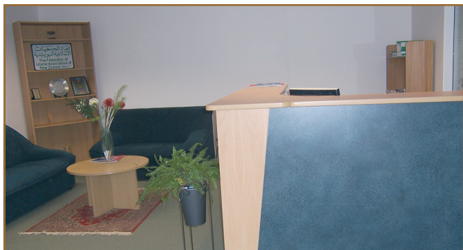
The beautiful new office at FIANZ, Wellington

FIANZ's spanking new office is functioning from its new premises at the ground floor of the Wellington Islamic Centre. The office has been simply, yet elegantly retrofitted for FIANZ. The entrance to the office begins with the reception area continuing with three offices. A long hallway leads to a large conference room. Behind the conference room is a storage room and amenities. A small kitchenette is also constructed to cater for the staff and for meetings.