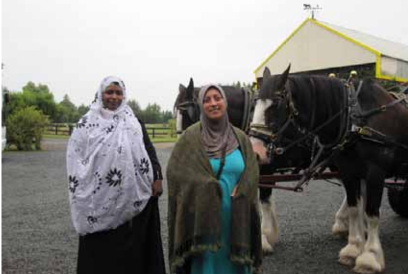
Two more sisters happy about the wagon ride during the IWCNZ Conference