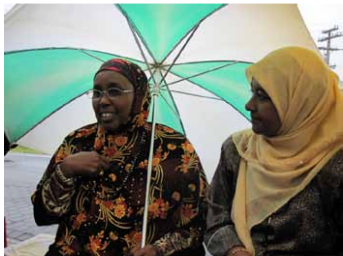
Sisters trying to stay dry during the wagon ride during the IWCNZ Conference.