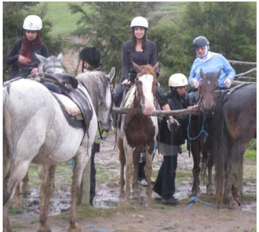
Horseriding in the rain during the IWCNZ Conference