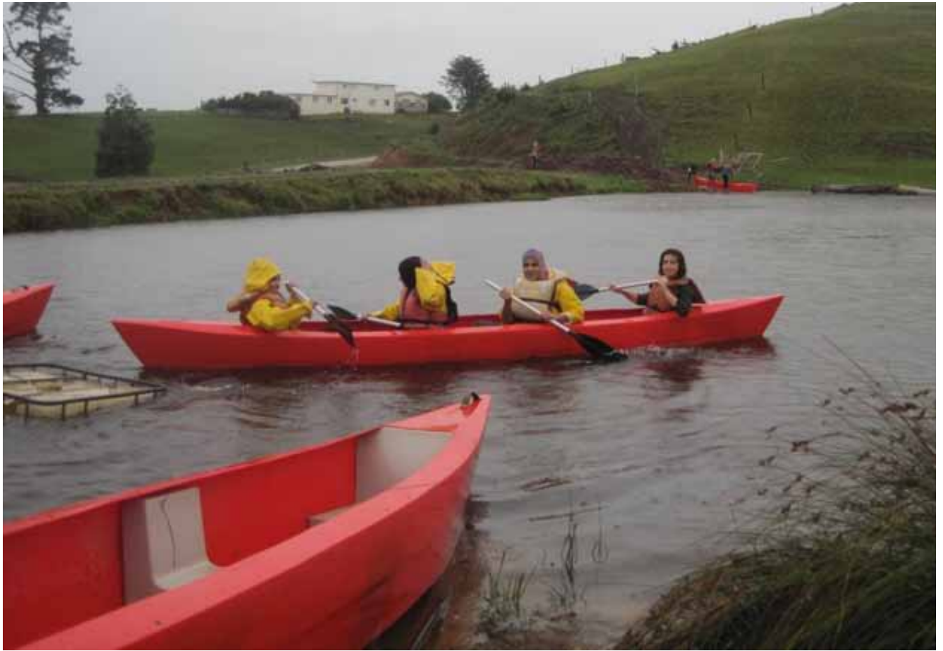
Sisters starting their canoe practice at the IWCNZ Conference.