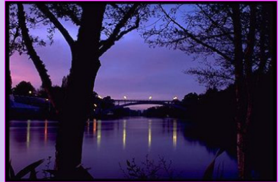
(Waikato River, Hamilton, New Zealand)

Accommodation, food and workshops are provided for the sisters at the conference and they just need to register.