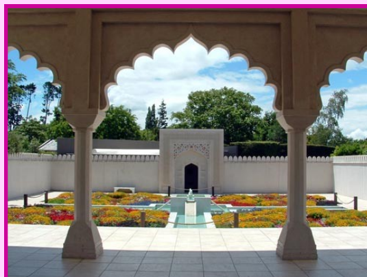
A picture of the Char Bagh Garden at Hamilton Gardens, N.Z.

Registration for outings and accommodation closes January 6, 2011.