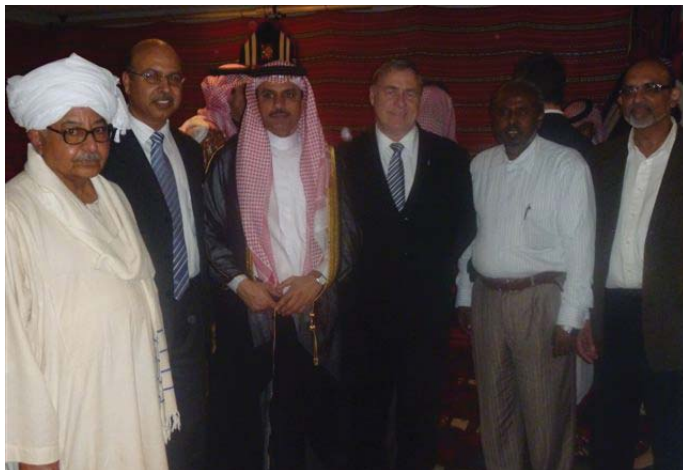
Dignitaries at the reception to mark Saudi National Day