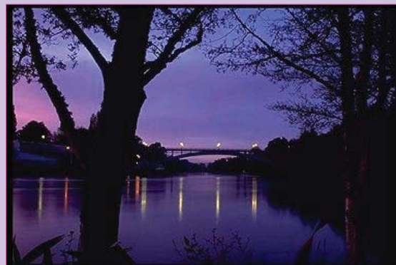
(Waikato River, Hamilton, New Zealand)

For more information about the event, to preregister for the conference and to receive notices about the activities, please send an email with your contact details to: