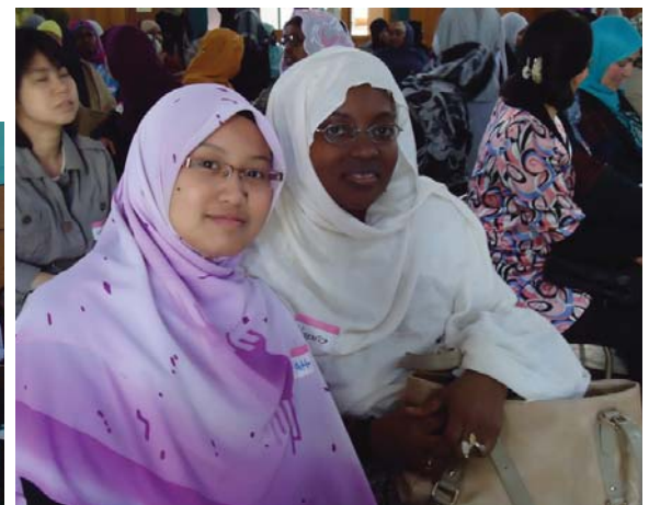
Participants at the workshop held in Christchurch on 2-3rd October. Approximately 150 Muslimah youth and adult women attended workshops in Christchurch and Dunedin.