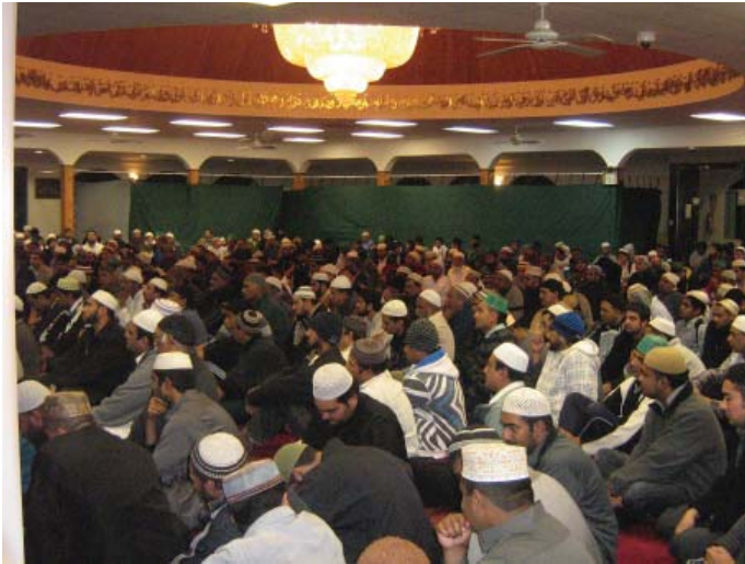
Brothers attending Taraweh prayers at Masjid Al Mustafa