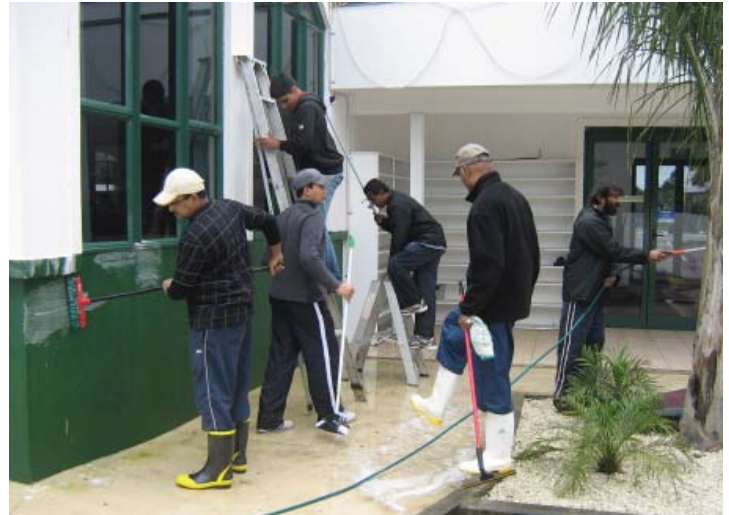
Brothers cleaning Masjid Al Mustafa in preparation for Eid

South Auckland Muslim Association with help of its members were able to arrange all the Iftars during the month of Ramadhan. The Eid ul Fitr was observed on Friday with Eid Salah starting at 7:30am. Approximately 1500 brothers and sisters attended the Eid Salah. The