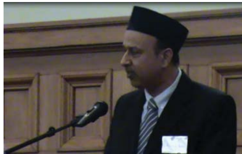
Dr. Anwar Ghani speaking at the Eid reception in Parliament Building, Wellington yesterday.

Speaking at the Eid reception hosted by Pansy Wong, Minister for Ethnic Affairs, in the Grand Hall of Parliament Buildings, Dr. Ghani said that Halal industry which not only included meat and meat by-products but also includes dairy products, cosmetic and pharmaceuticals is a unique contribution of Muslims and